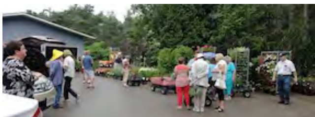
Shopping at John's Garden.