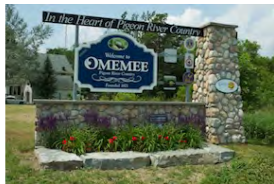
The sign bed at the village entrance.