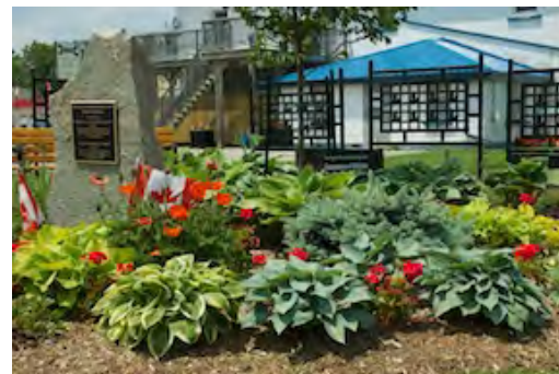
Poppies blooming in the Legion Bed.