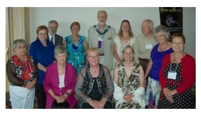
Thunder Bay Convention delegates from District 4

http://www.gardenontario.org/docs/ trillium_news_2013_03-fall.pdf