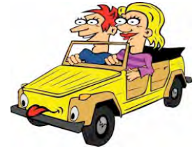
Car Pool -It's Fun!