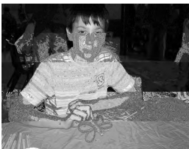
Junior Garden Club 2011