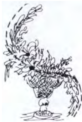
Hogarth or S Curve